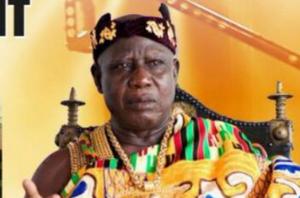
Barima Offe Akwasi Okogyasuo II. Kokofuhene