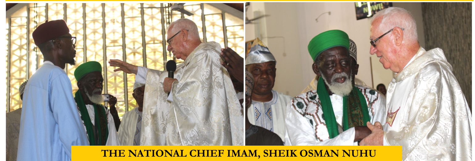
THE NATIONAL CHIEF IMAM, SHEIKH OSMAN NUHU SHARUBUTU PAYS COURTESY CALL ON CHRIST THE KING CHURCH ON EASTER SUNDAY