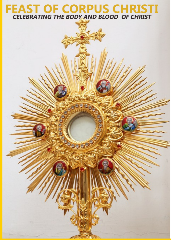
FEAST OF CORPUS CHRISTI CELEBRATING THE BODY AND BLOOD OF CHRIST