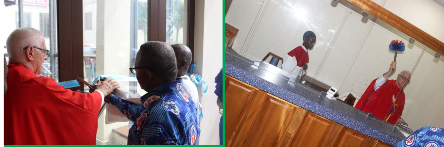
BLESSING AND OPENING OF NEW CREDIT UNION OFFICE