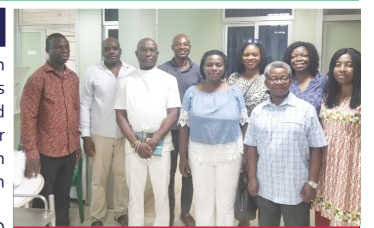
St. Vincent de Paul Society donates to some patients of Easmond Ward, 37 Military Hospital.