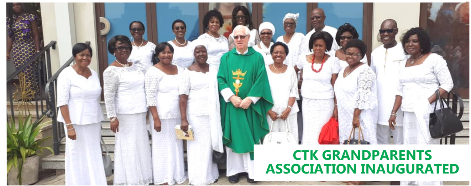
CTK GRANDPARENTS ASSOCIATION INAUGURATED