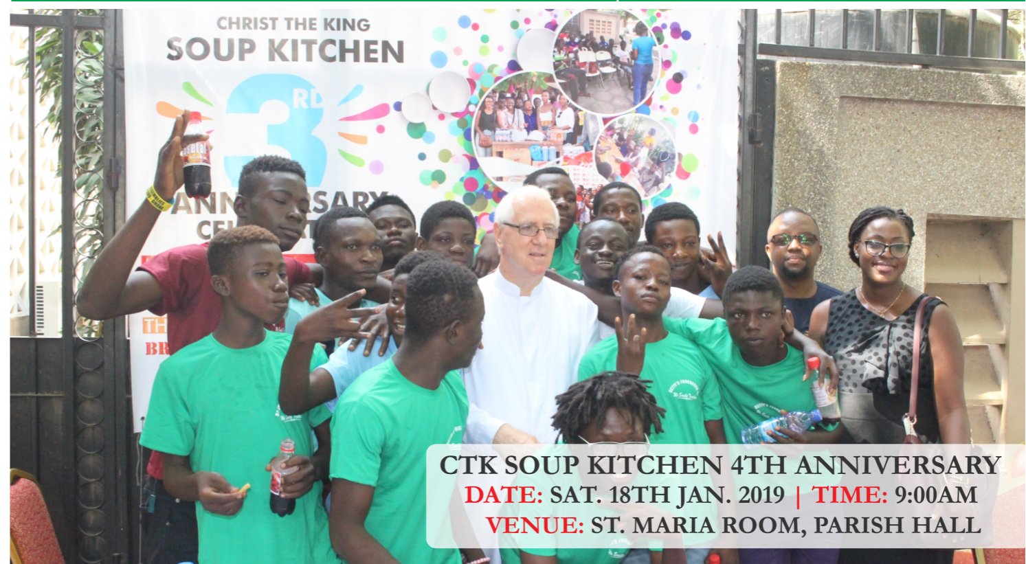
CTK SOUP KITCHEN 4TH ANNIVERSARY DATE: SAT. 18TH JAN. 2019 | TIME: 9:00AM VENUE: ST. MARIA ROOM, PARISH HALL