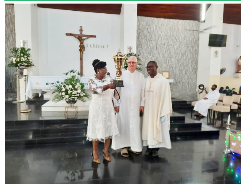
WOMEN CROWNED CHAMPIONS OF 2020 MEN VS WOMEN COMPETITION

Saturdays : After Morning Mass & 5.00pm (Adoration Chapel)