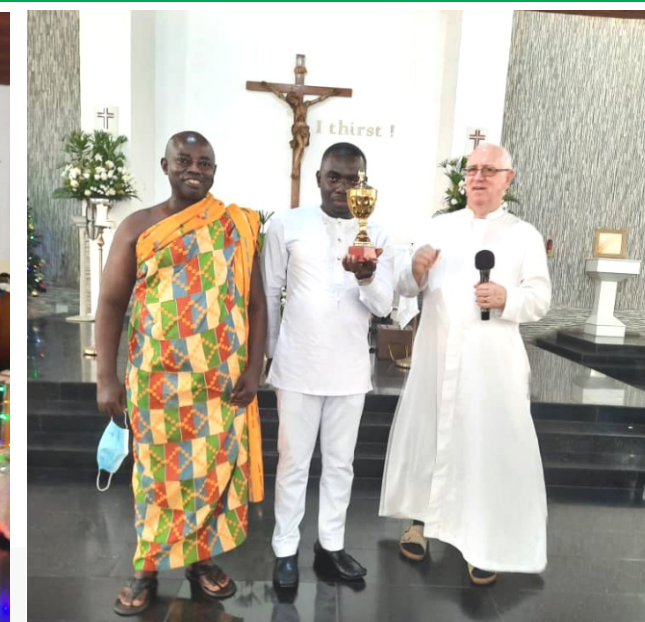
SUNDAY BORN'S WIN DAY BORN COMPETITION 2020