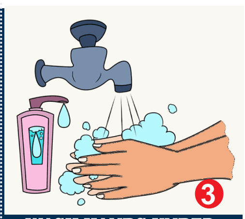
WASH HANDS UNDER RUNNING WATER