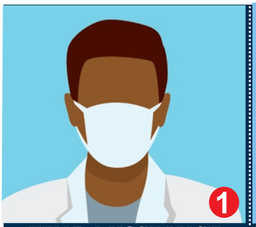
WEAR A NOSE MASK AT ALL TIMES