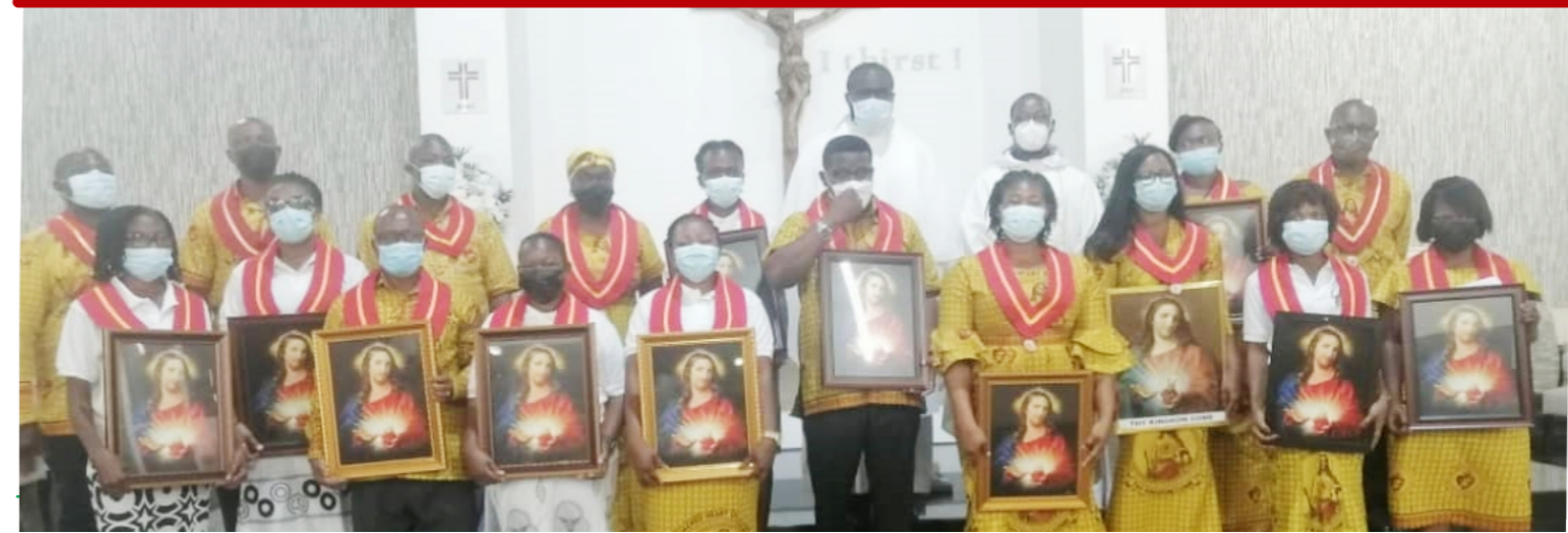
INITIATION OF NEW APOSTLES INTO THE SACRED HEART OF JESUS CONFRATERNITY

"CELEBRATING OUR FATHERS" Messages from our children from the Sunday School - see middle page