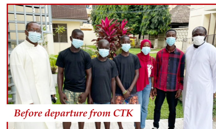
Before departure from CTK