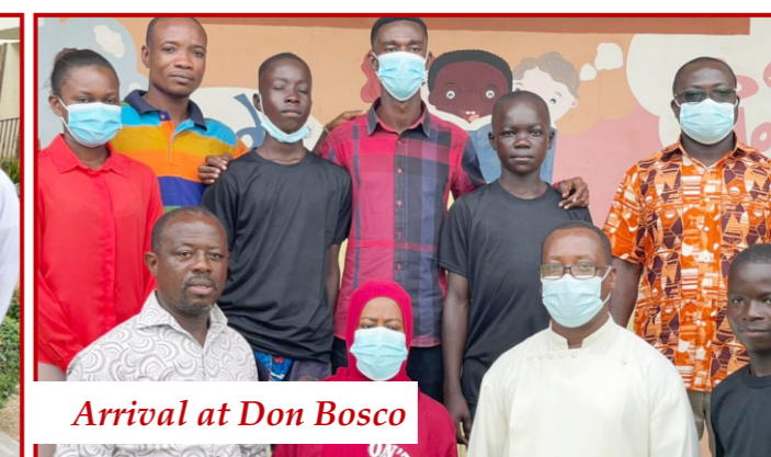
Arrival at Don Bosco

Christ the King sends three (3) Soup Kitchen beneficiaries (in black) to Don Bosco Childrens' Village for rehabilitation.