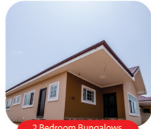
2 Bedroom Bungalows