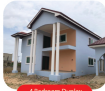
4 Bedroom Duplex under construction