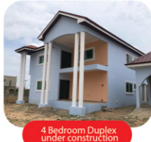
4 Bedroom Duplex under construction