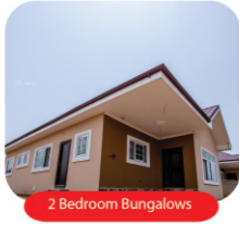
2 Bedroom Bungalows